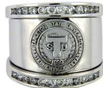
Clytie Starting at $595