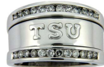
Cheryl Starting at $520