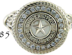
Channel Starting at $485