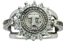
Carissa Starting at $595