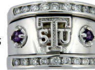
Brooke Starting at $545