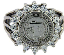
Baily Starting at $445